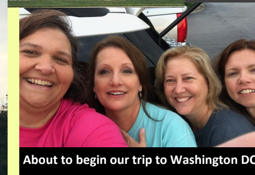
About to begin our trip to Washington DC