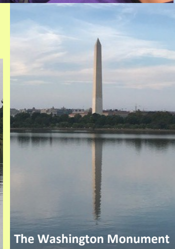
The Washington Monument