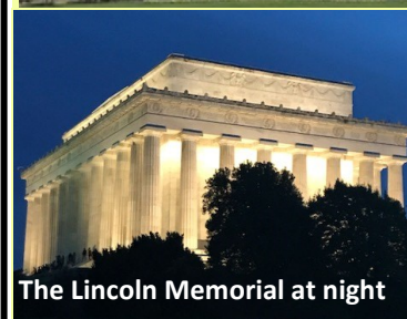
The Lincoln Memorial at night

Waiting to board the Metro-that was a new experience for all of us! We used the Metro to get around DC and it made all of us grateful that this was not a way of life for us!