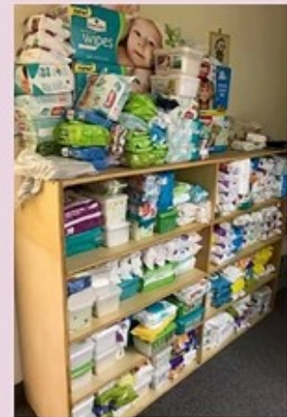
These Pictures represent just a small portion of donations that we have been blessed with. Our God is Good!